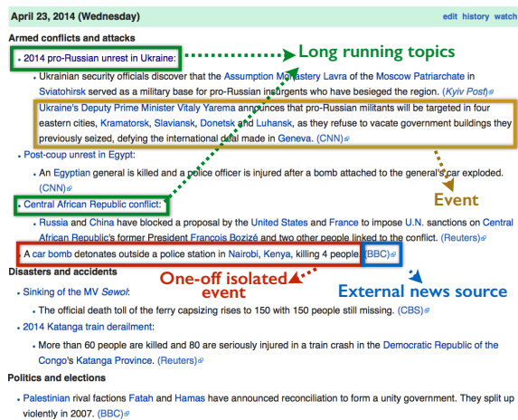
(a) Wikipedia Current Events Portal daily summary